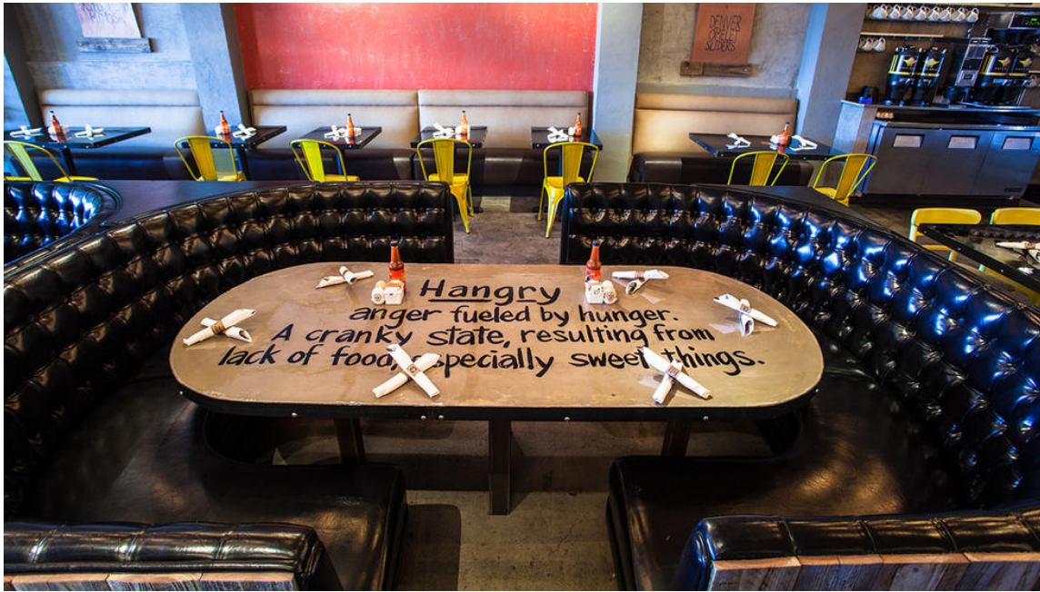
7/14 The eatery is also known for its “egg-cellent” décor, including funny signage and cool art.