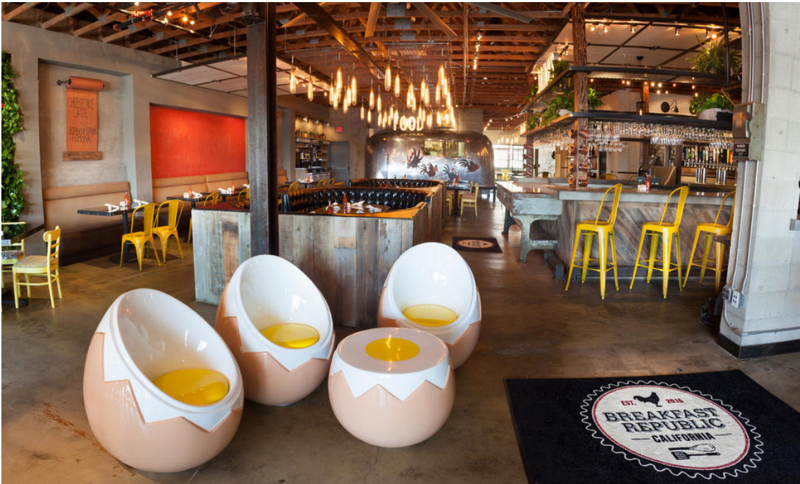
5/14 The eatery is also known for its “egg-cellent” décor, including funny signage and cool art.