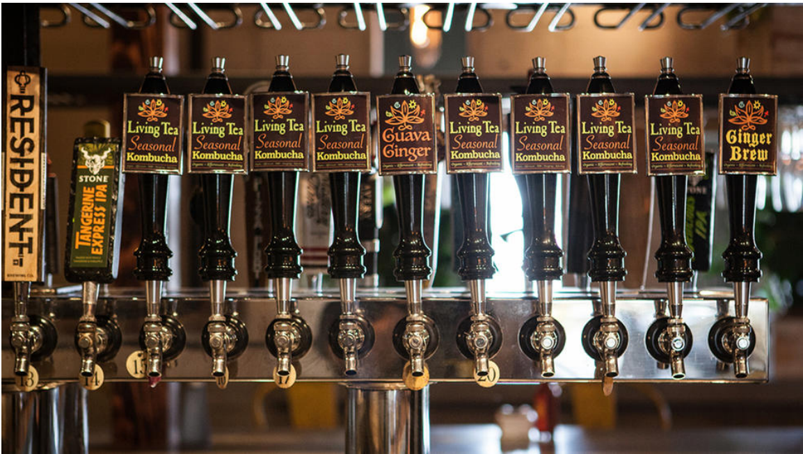
6/14 The bar is also home to 10 taps of different kombucha flavors and cold brew on nitro.