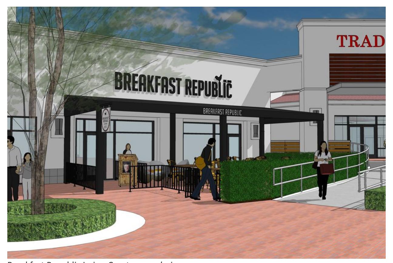
Breakfast Republic Irvine Courtesy rendering

A <u>Breakfast Republic</u> for every neighborhood might not be such a far off prospect. Multiplying at an astonishingly quick pace since first launching in 2015, there are now seven locations and counting. The most recent outpost launched last month in Pacific Beach while <u>the next is due in</u> <u>Carlsbad</u> this summer.